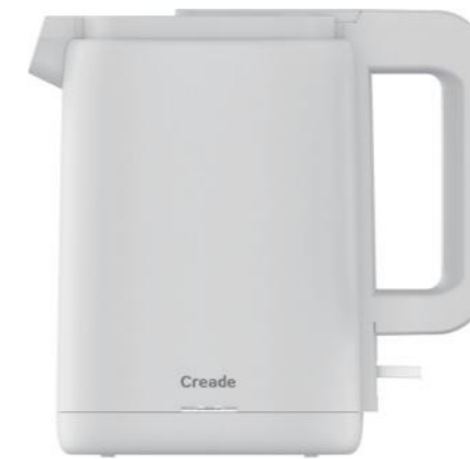
BW361 White 1360W/0.8L