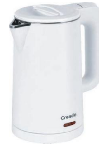
BW359 White 1000W/0.8L