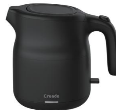
BW366 Black 1360W/0.8L