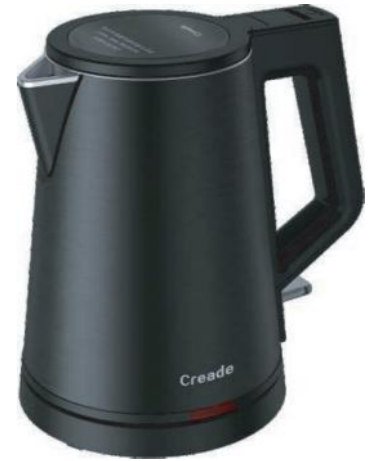
K-D08-F Black 1000W/0.8L