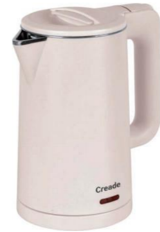
BW359 Beige 1000W/0.8L