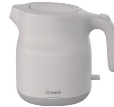
BW366 Light Grey 1360W/0.8L