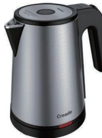
K-0107 Silver 1000W/1.0L