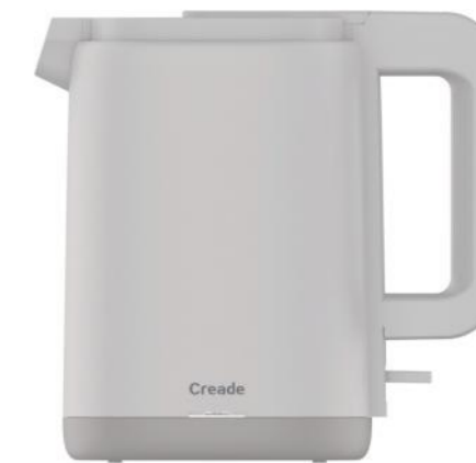
BW361 Grey 1360W/0.8L