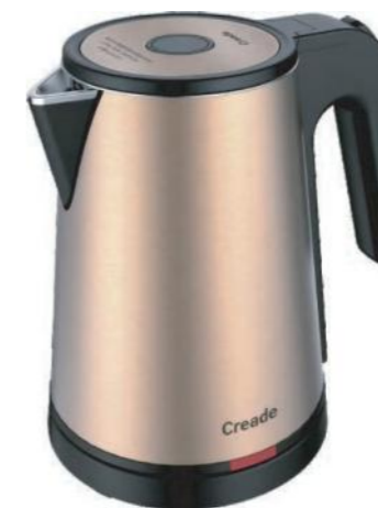
K-0107 Golden 1000W/1.0L