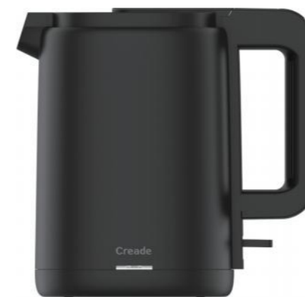
BW361 Black 1360W/0.8L