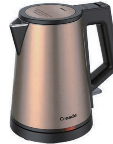
K-D08-F Golden 1000W/0.8L