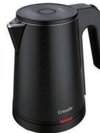
K-0107 Black 1000W/1.0L