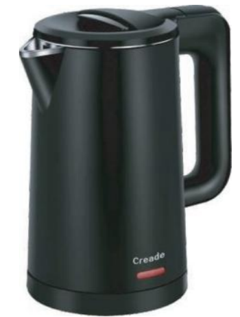
BW359 Black 1000W/0.8L