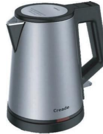
K-D08-F Silver 1000W/0.8L