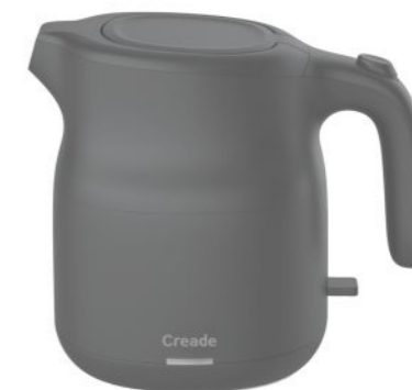
BW366 Dark Grey 1360W/0.8L